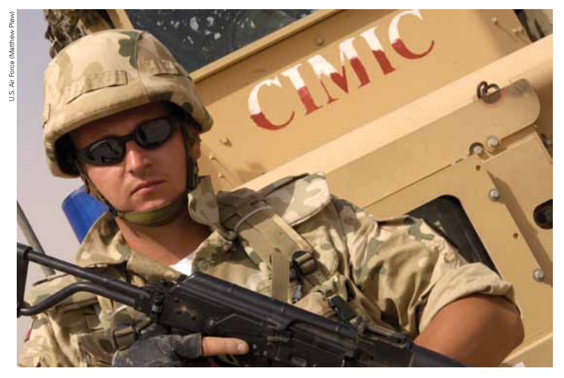
Polish soldier with CIMIC team inspects local projects in Ad Diwaniyah, Iraq, May 2008

While the concept generally calls for consistent integration across all echelons from the political to the tactical level, 13 its practical use as an effective tool is almost exclusively limited to the tactical, and in the operational-level